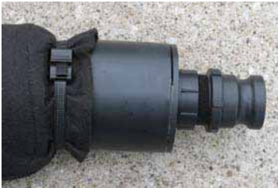
Two-inch Camlock quick connect fitting.