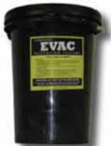
UN certified liquid-tight container.

*Always check with Local, State, and Federal Regulations prior to disposal.