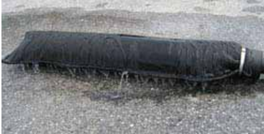
EVAC Filtration System filtering water.